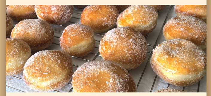
Learn how to make these traditional, sugar-dusted donuts