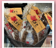
CFX Chocolate Factory

Contact the Office to reserve your seat: 519-742-7979