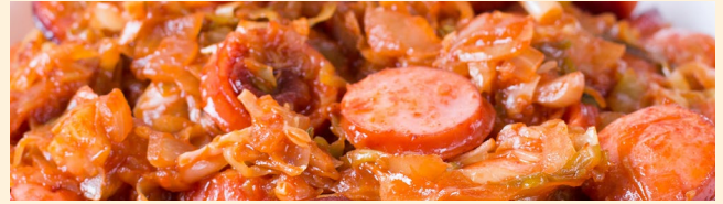
Paradeiskraut: A Donauschwaben dish including cabbage and sausage in a tomato juice sauce