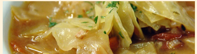
Süß-saureskraut: A Bavarian dish including cabbage and pork meat in a sweetened vinegar sauce