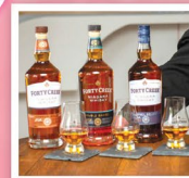
Forty Creek Whisky