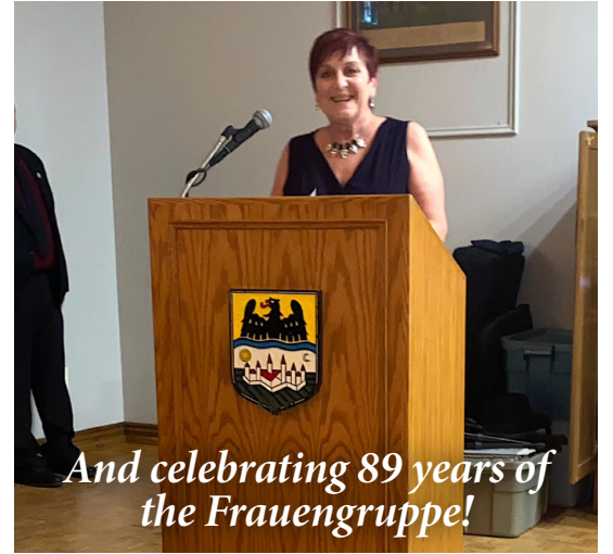
And celebrating 89 years of the Frauengruppe!