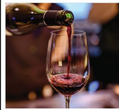
Magnotta Winery Complimentary tour & tastings