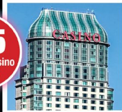
Fallsview Casino $35 in casino credits per guest