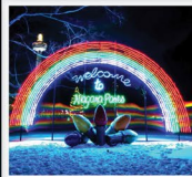
Winter Festival of Lights View lighting displays upon departure

Contact the Office to reserve your seat 519-742-7979