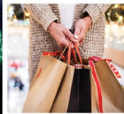
Outlet Collection in Niagara For Christmas Shopping