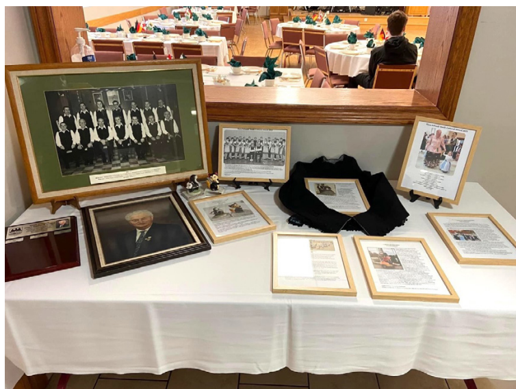
Entries for the Hans Schaadt Youth Cultural Award, on display.

Membership Director & Sick Benefits Financial Secretary