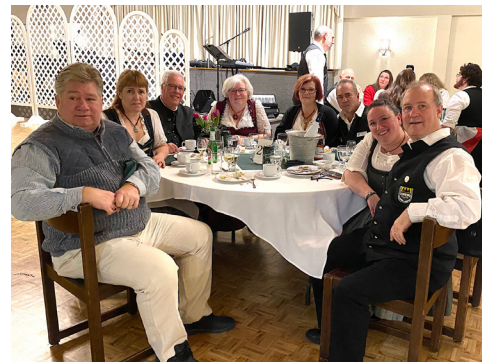
Schwaben Club members and Board members attending Kameradschaftsabend at the Concordia Club.