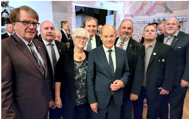
The KW German Club Presidents with the German Chancellor, Olaf Scholz.