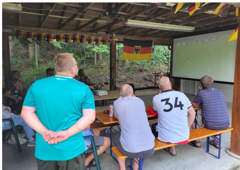
Ladies' EuroCup Final with Germany vs England.