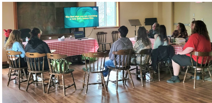
The Freundschaftsgruppe's Jack Box Game Night.

President, Verband der Donauschwaben in Kanada