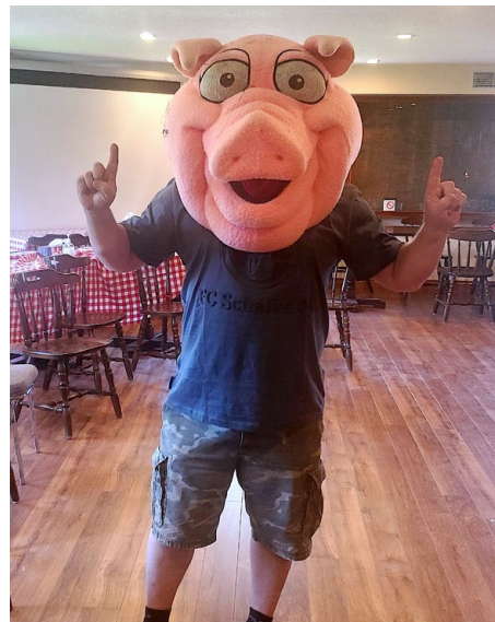
Our Club President "porking" around!