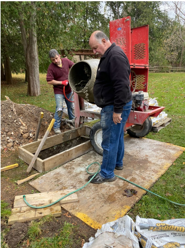
100 bags of concrete were used to make a sturdy foundation. These were generously donated by Joel Wideman's employer - Quikrete.