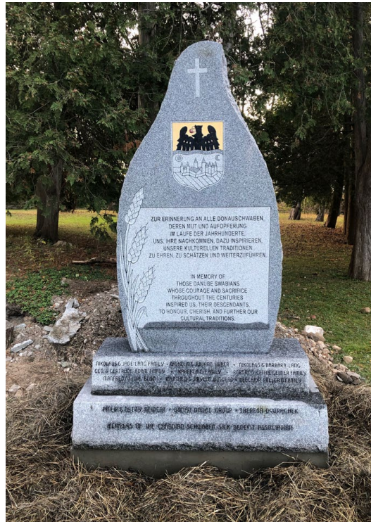
Successfully placed in its new location - and freshly washed!

Landscaping and placing the memorial pavers will be a future project.