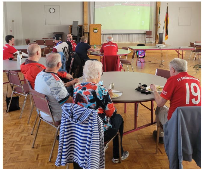
Mia San members watching a game.