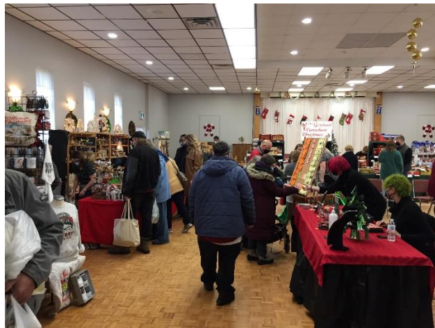
Christmas Market at the Schwaben Club

The office will reopen in the New Year on January 4 th .