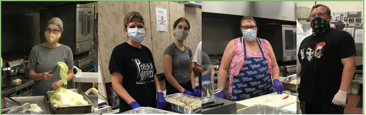
Cabbage Roll Making and Dinner, Member's Meeting, Elvis was in the house!