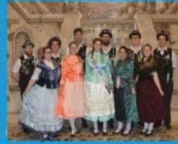
Toronto Jugend Group