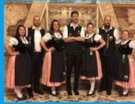
Toronto Blue Danube Heimat Group