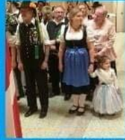
Kitchener Schwaben Club