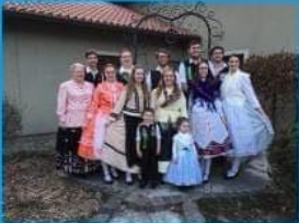
Kitchener Schwaben Club