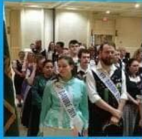
Toronto Schwaben Club