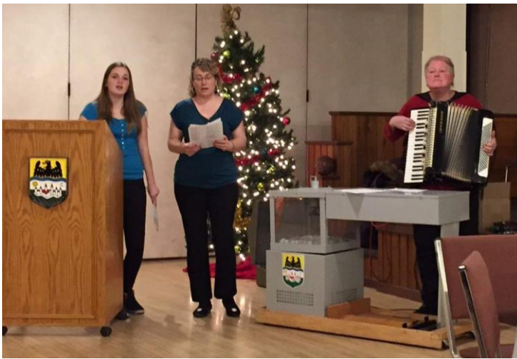
December 5 th , 2018 Christmas Dinner