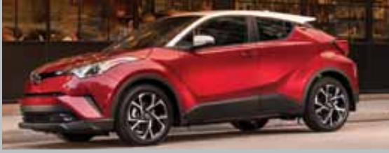
All New 2018 Toyota C-HR - See it today!