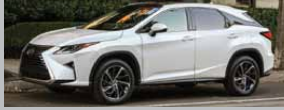
2017 Lexus RX - See it today!