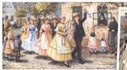
Paintings by Stefan Jäger

Should you have any issues or concerns with this issue of the Nachrichten, please email them to: wdschwaben@gmail.com