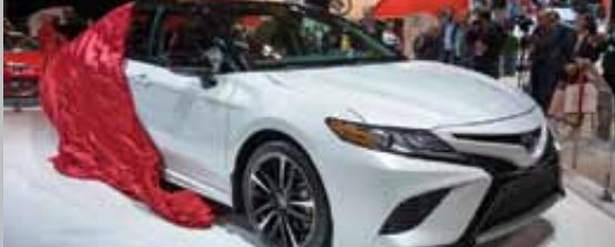
All New 2018 Camry - Coming Fall 2017!