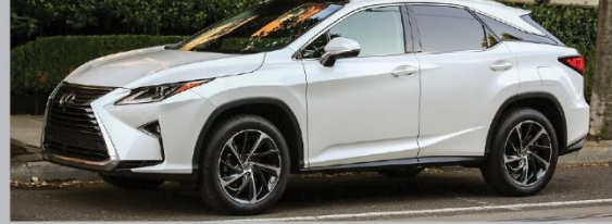
All New 2018 Lexus LS- Coming October 2017