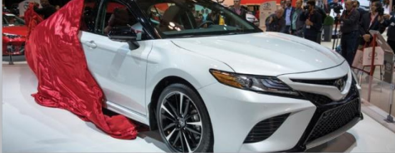
All New 2018 Camry - Coming Fall 2017!