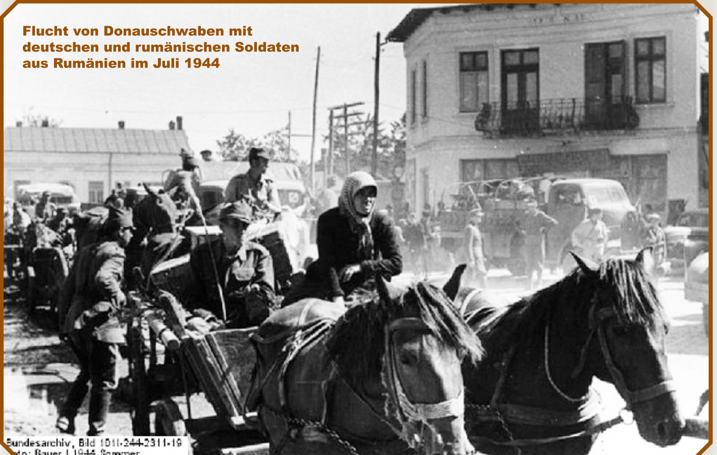
Flucht von Donauschwaben mit deutschen und rumänischen Soldaten aus Rumänien im Juli 1944