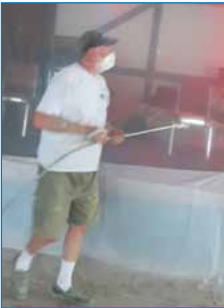
Painting Schwaben Hall Ceiling