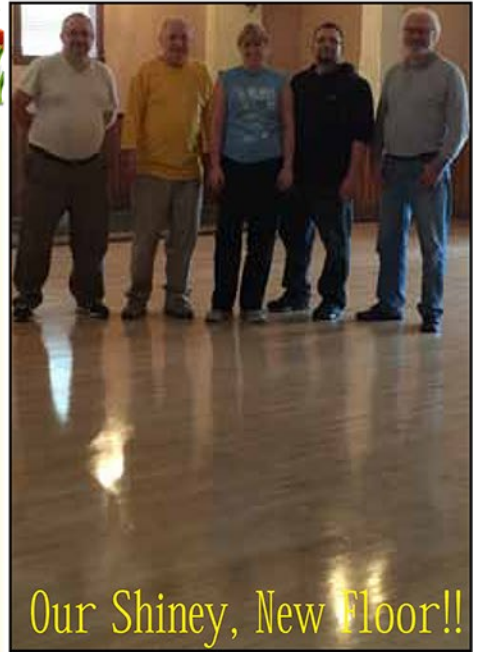
Our Shiny, New Floor!!