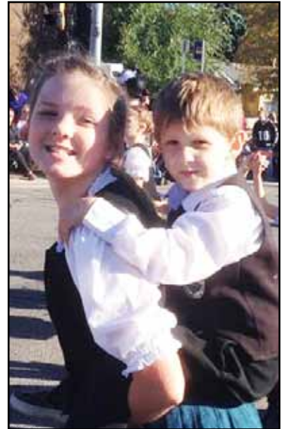
AT THE MARKET