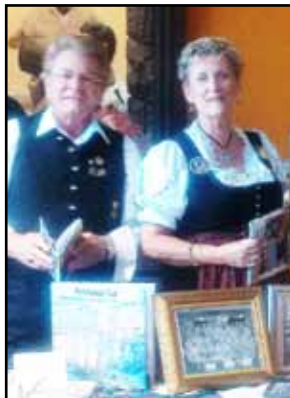
THE PICTURES WHICH FOLLOW THROUGHTOUT THE NACHRICHTEN ARE OF THE SCHWABEN DANCERS IN ATLANTIC CITY