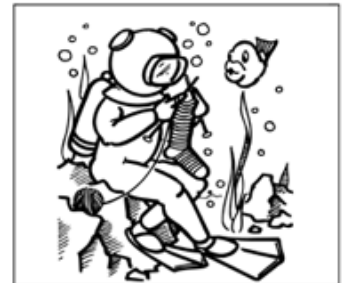
Diese beiden Zeichnungen sehen nur auf den ersten Blick vollkommen gleich aus - tatsächlich unterscheiden sie sich durch fünf Kleinigkeiten - welche?