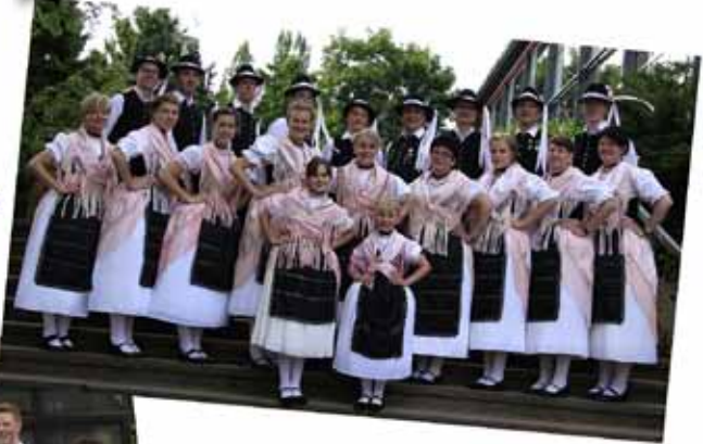
Brauchtums- und Volkstanzgruppe der Banater Schwaben, Esslingen-Wendlingen