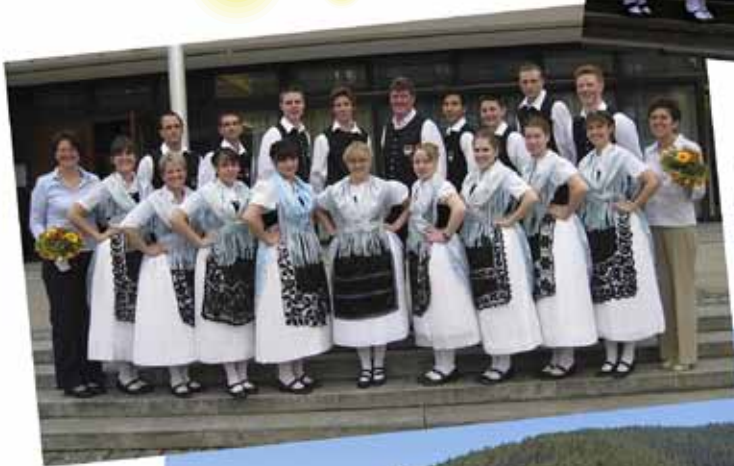
Tanzgruppe der Banater Schwaben aus Singen