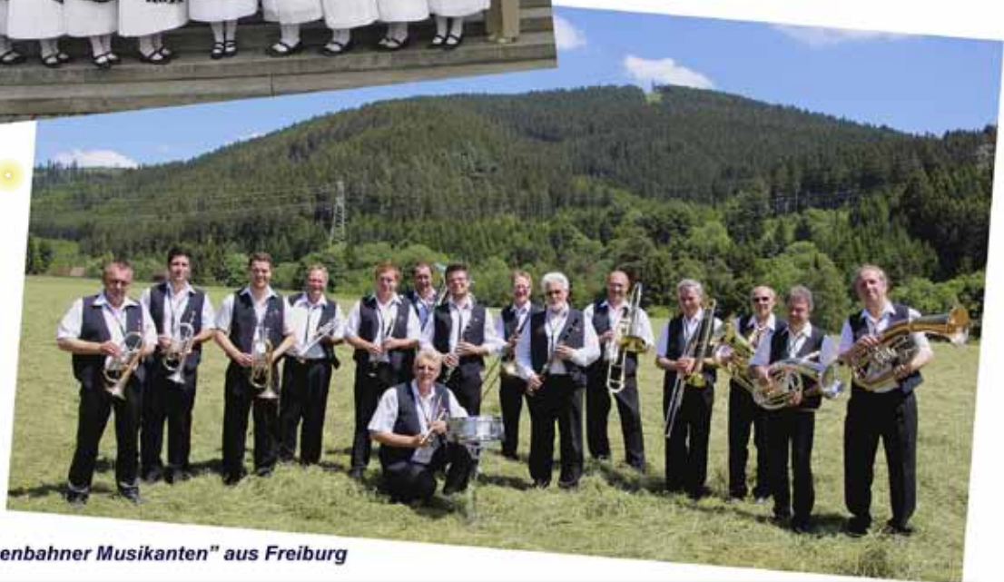
Die "Eisenbahner Musikanten" aus Freiburg