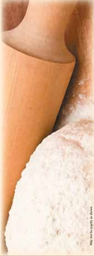
May not be exactly as shown.